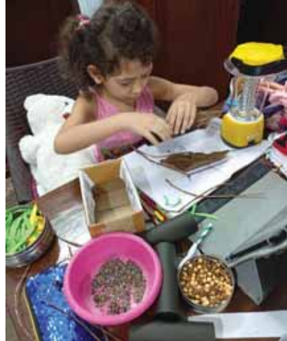
A student works alongside her classmates on the screen to build a Hotel for Bugs