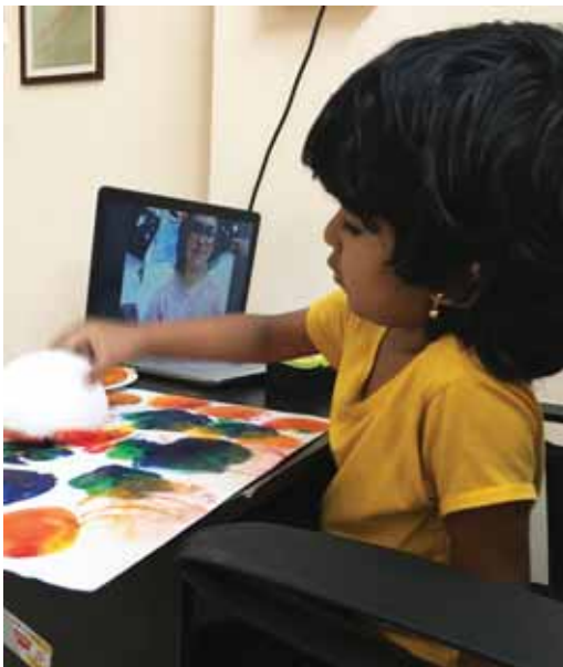
An LKG student tries a new painting technique