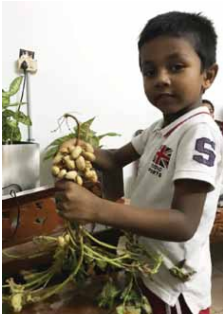
A student harvests groundnuts