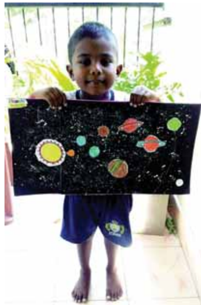
Holding up a painting of the Solar System, created as part of the “Into Space” exploratory project