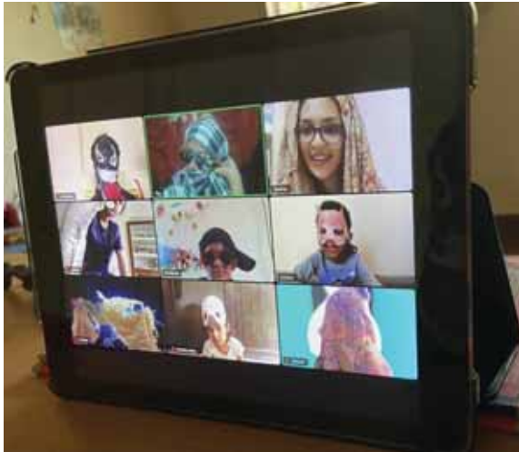
Snapshot of an online session. Students come dressed as their favourite characters ahead of Halloween