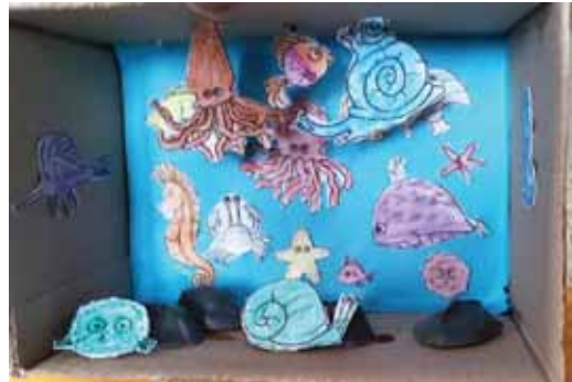
An “under the sea” diorama by our pre-KG student