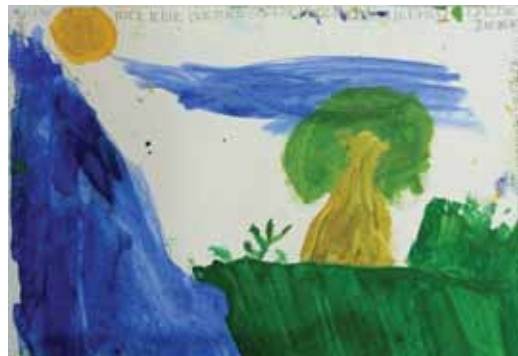
Nature Journaling, a weekly session of expression and creativity