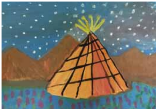
A student's rendition of a Tepee against a starlit sky